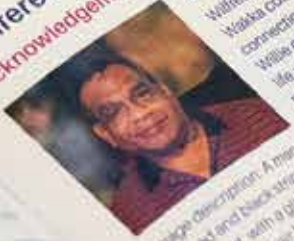
Image description: A man in a red and black striped polo shirt with a glimpse of a wheelchair back behind his shoulders. He is wearing square shaped glasses and smiling slightly and warmly.